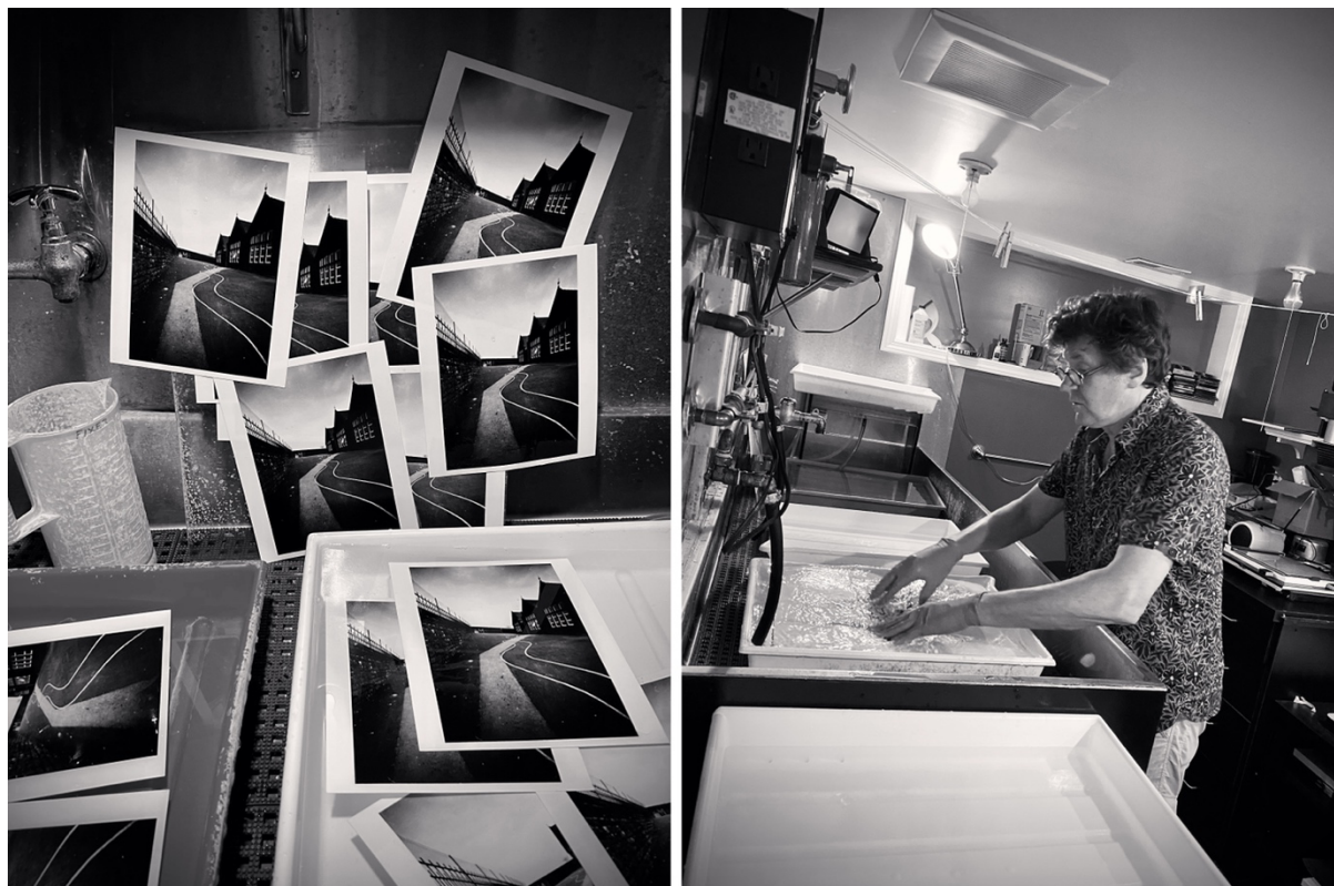
Left: Getting There, 12 Working Prints, School Yard, Heptonstall, Yorkshire, England. 1983 Right: Michael Kenna Developing A Print In His Darkroom In Seattle, USA. 2021

“Reflecting on 50 years of silver gelatin printing, a somewhat arduous, slow and painstaking process, I believe the final prints make it all very well worthwhile. Photographs, embedded in the gelatin, have been transformed in an almost alchemical process into three-dimensional precious, jewel-like prints. Machine-made pigment prints are of excellent quality, but, at least for me, silver prints remain the gold standard in photography. It is also comforting to know that these prints are made to archival standards which means they should well outlast myself and collectors. I keep records of every print I have signed and editioned, and have prints in my own collection which I made 50 years ago. They are as good today as when I first made them.”