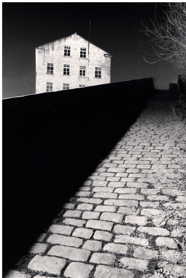
Left: Michael Kenna, 2011 | Right: Bill Brandt's Snicket, Halifax, England. 1986

Online Photography Exhibition 'Retired Negatives' by Michael Kenna